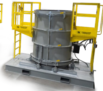
Smart Form Technology