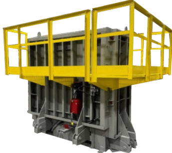
Four Roll Back Box Form with Catwalk