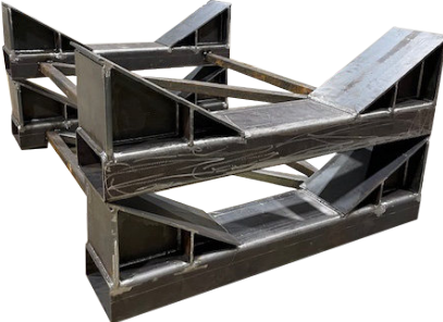
Precast Pipe Handling System