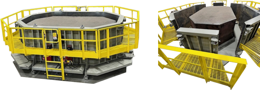
Four Roll Back Octagon Form with 360 Catwalk