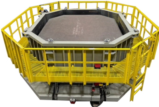
Sureway "Smart" Octagon Form