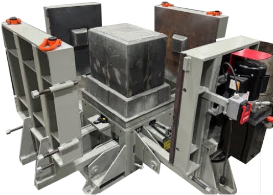
Small Four Roll Back Form