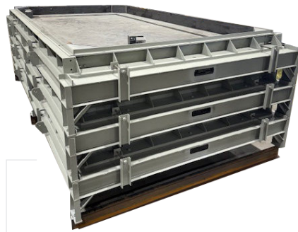
Stackable Slab Forms