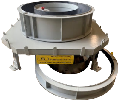
Individual Pour Grade Ring