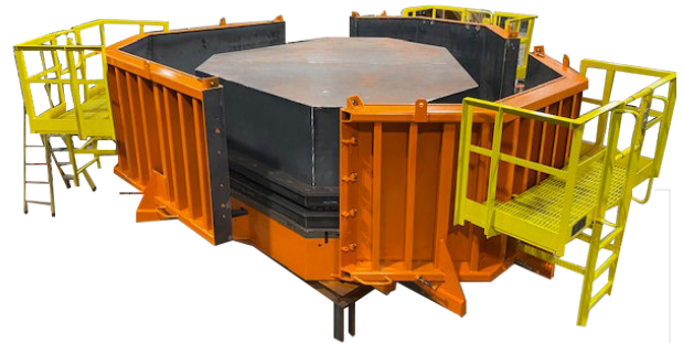
Three Sided Roll Back Form