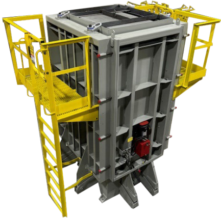
Four Roll Back Complete with Haunch