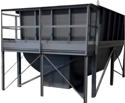
Emergency Shelter Form