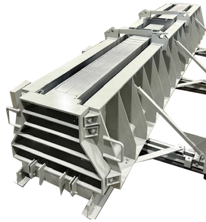
Roll Back Barrier Form