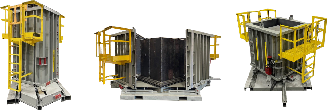
Two Piece Roll Back Form