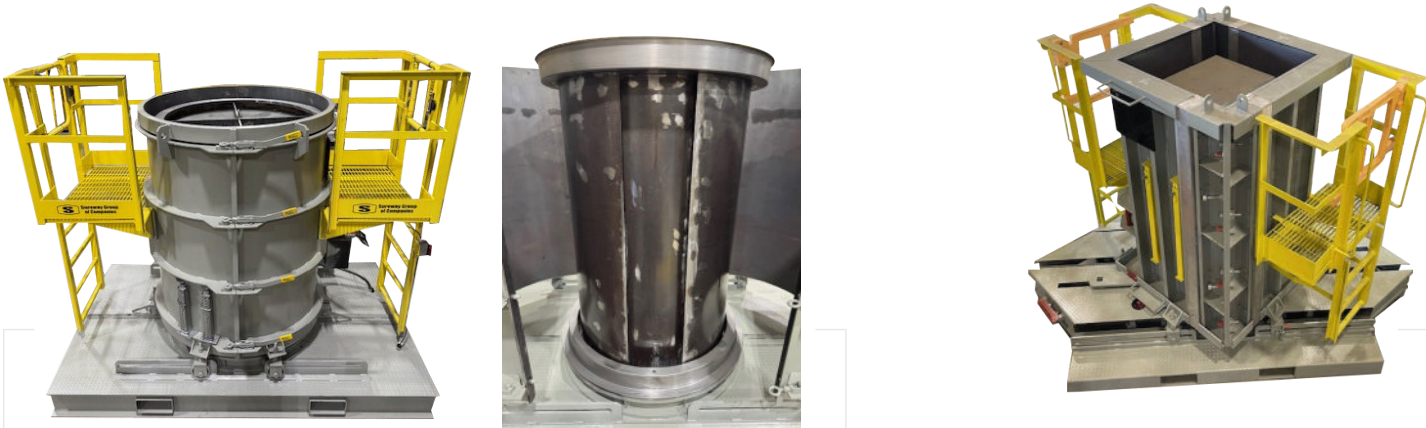
Pipe Form, Hydraulically Collapsing Core