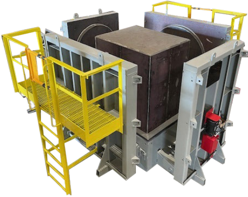
Four Roll Back Box Form Complete with Knockouts