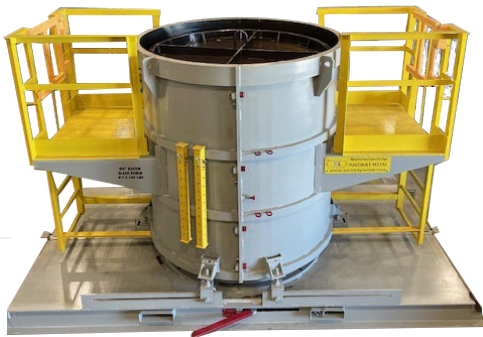
Manual Collapsing Pipe Form