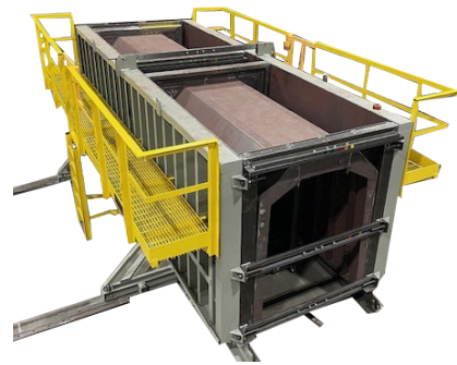
Box Culvert (Extendable)