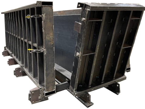
Roll Back Fold Back Combination Box Form