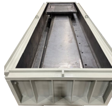
Curb Inlet Form