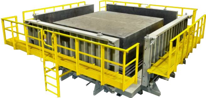
Sureway "Smart" Box Form